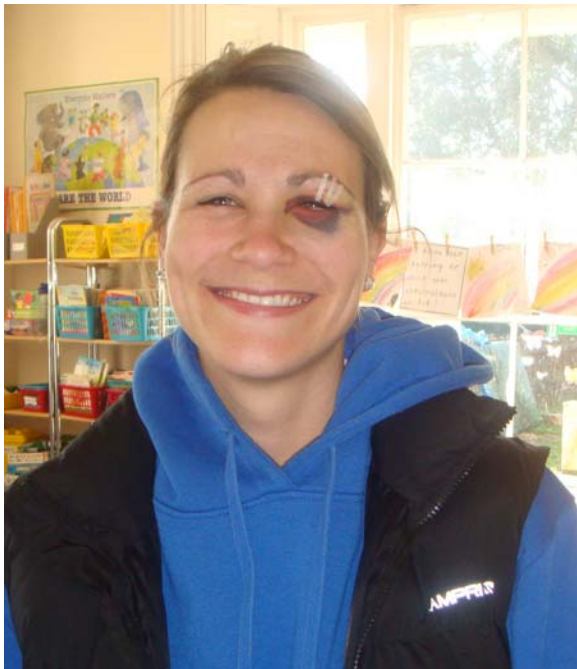
The shining face of a happy sportswoman...