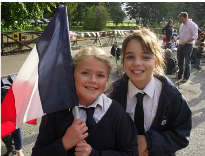
Our French Breakfast was a wonderful family occasion.

We will be participating this year in a Christmas Card Project with professionally printed cards using your child's artwork. Artwork will need to be in by 7th November. More information to follow.