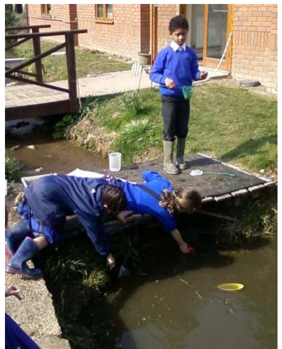
Children are allowed to explore their environment. We are not afraid to get dirty as we learn and play!

All this is music to this headmaster’s ears. It is encouraging to know that Spring Grove is not the only small prep school. We have a school where everybody gets a go, where the staff go the extra mile to bring the best out in the children by providing a rigorous curriculum tailored to the individual’s need, where the children are happy and develop into articulate, positive, hard-working young adults. A glance at the successes of this year’s Prep 6 show this small prep school is achieving its targets.