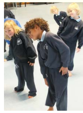
Expert warm-ups get our bodies ready for physical exercise!