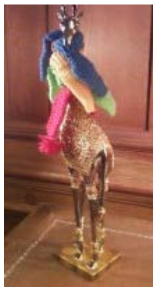
Gerry the Giraffe—the trophy presented each week to the House that gains the most House Points.