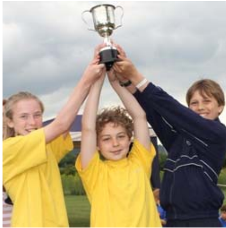
Chaucer's Captains proudly hold aloft their Sports Day trophy.

With just a few days to go to the end of term, please ensure that you have read about the special programme for next week.