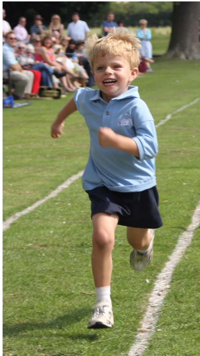
Running with a smile: Sports Day was a happy celebration of athletic and academic achievement.